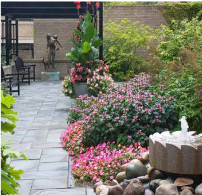
Gifts of Art's Friends Meditation Garden in Ann Arbor, Michigan is an outdoor space of comfort and respite. The garden was designed utilizing preference research from inpatients in collaboration with researchers from the University of Michigan School of Natural Resources.

Landscape architecture, like building design, can be an art form in itself without the inclusion of any added art installations or objects. The Zen gardens of Japan have been a great example of this through the ages. Garden design provides a wonderful opportunity for custom art integration that can bring specific cultural, holistic connections to the community as well as qualities of discovery, whimsy, reflection, and beauty to garden installations. The public art realm has been partnering artists with landscape designers for many years and this practice is now spilling over into healthcare garden design as well.