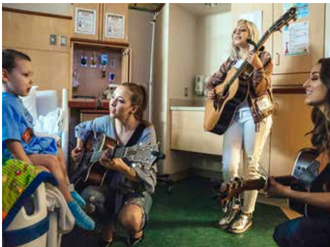
Musicians on Call, based in New York City, matches volunteer musicians with healthcare facilities to provide bedside music services. The program has now expanded to 20 cities throughout the nation.

There is nothing new about artists engaging in healthcare settings such as hospitals, hospices, nursing homes, and long-term care centers. For many decades, visual artists and performing artists have provided arts experiences that have enhanced the environment of care. But as experience, education, research, and professionalism have contributed to the ongoing advancement of arts in healthcare programs, best practices are emerging that can guide program administrators and artists in implementing programs that will yield clear benefits to patients and caregivers, and also comply with established standards for patient safety and professionalism.