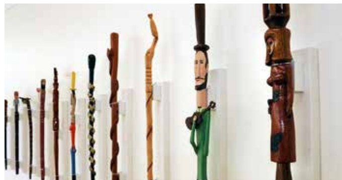
The UK Arts in HealthCare Program at UK Albert B. Chandler Hospital in Lexington, Kentucky brings together visual and performing arts, incorporating the unique aspects of Kentucky's landscape, art and music. Kentucky Folk Art Canes, Various artists.

Whereas the primary purpose of visual art displayed in healthcare settings continues to be the engagement, relaxation, and stress reduction of patients, staff, and visitors, curators of permanent art collections and rotating exhibits are increasingly broadening their selection criteria to address additional goals of visual art selections. Evidence-based design emphasizes the power of natural landscapes as a healthful visual stimulus. Hospital art directors and committees sometimes prefer representational art that contains soothing and recognizable images that are easily understood, such as nature and soothing water scenes. However, it can be argued