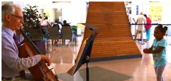
The Arts in Medicine Program at The MetroHealth System in Cleveland, Ohio offers music, dance, theater, visual arts and community arts programs, and provided over 700 hours of live music programming in 2016.

Significant growth of the arts in health arena can be witnessed in the public health context, with many programs now exploring ways that artists, creative arts therapists, and expressive arts therapists can contribute to community health goals. Generally, these programs benefit communities by engaging people in arts programs intended to promote prevention and wellness activities. The arts in this context are also used effectively to communicate health information to improve health literacy. Important new developments in community health include a focus on age-friendly community services, caring for military and veterans' populations, addressing health care needs of people with chronic illnesses, caring for homeless populations, and responding to the opioid epidemic.