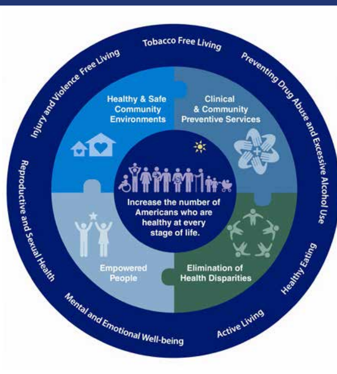
FIGURE 2: Strategic Directions and Priorities of the National Prevention Strategy, U.S. Department of Health and Human Services

Professionals in the field of arts in community health seek to improve the health and well-being of all Americans at every stage of life. This area of practice supports the work of numerous federal programs, most notably the National Prevention Strategy: America’s Plan for Better Health and Wellness released by the National Prevention Council in June 2011 (see Figure 2) and the Healthy People 2020 initiative launched by the US Department of Health and Human Services in 2013. Healthy People 2020 places its primary emphasis on community-based initiatives, and identifies Social Determinants of Health as being a key factor in determining health. The conditions of Social Determinants are identified as the environment in which one is born and where one lives, works, and plays; culture is provided as an example.