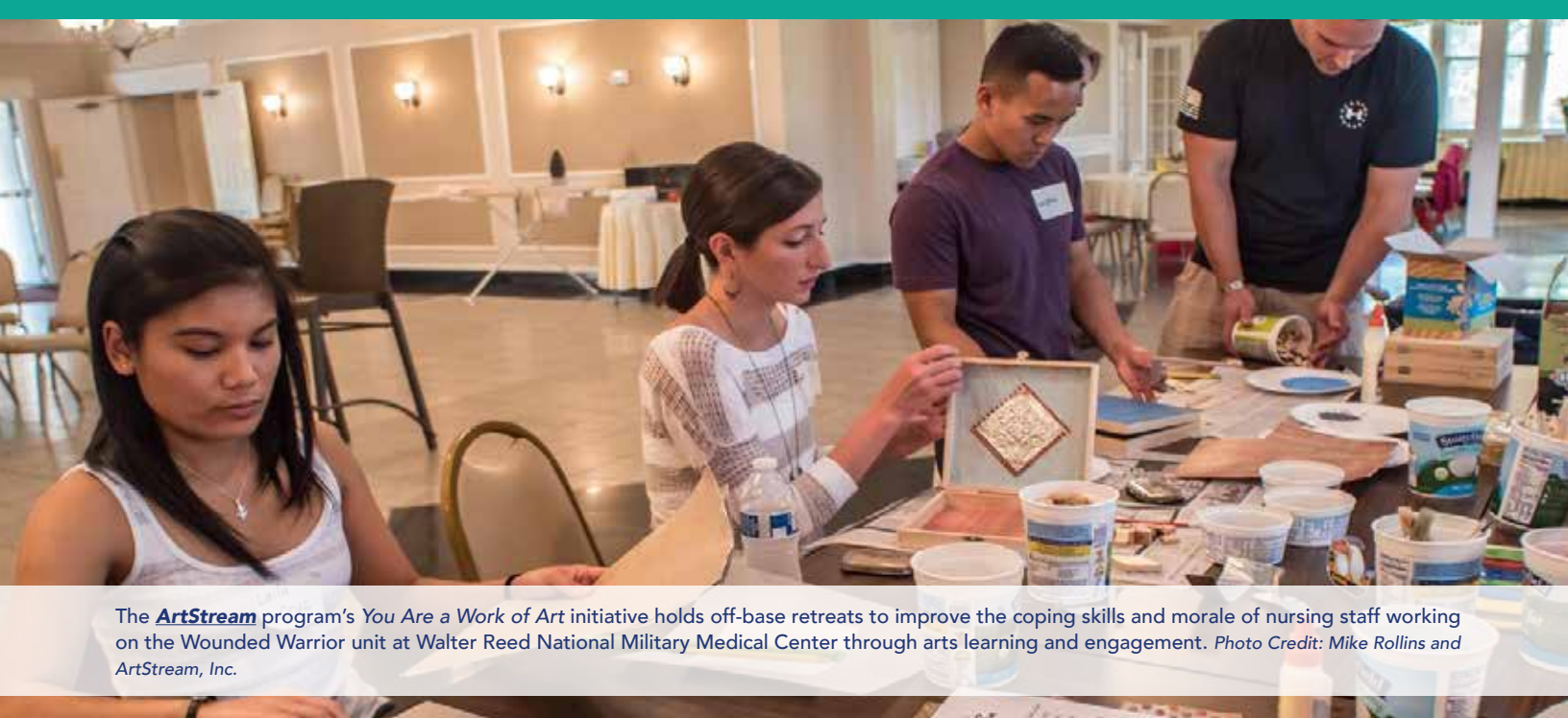
The ArtStream program's You Are a Work of Art initiative holds off-base retreats to improve the coping skills and morale of nursing staff working on the Wounded Warrior unit at Walter Reed National Military Medical Center through arts learning and engagement.