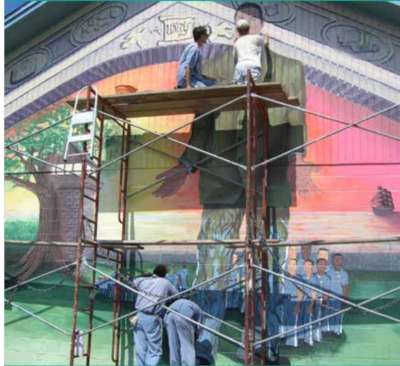
Transformation through Unity, a large-scale mural at a men's prison in Tallahassee, Florida. Collaboration of the Florida State University Graduate Art Therapy Program and the Florida Department of Corrections.