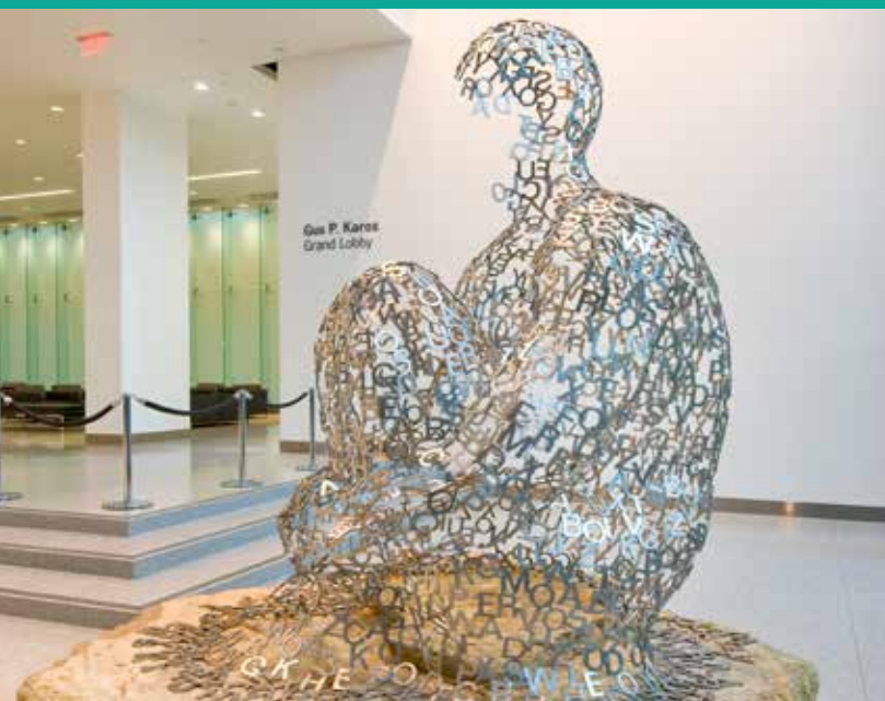
Jaume Plensa, Cleveland Soul , 2007, stone and steel. The commissioned sculpture was placed at the entrance to the hospital and is set on a 5-ton boulder. The Cleveland Clinic Art Program features over 6,000 works by national and international artists.

The Cleveland Clinic's Art Program is one of the most extensive hospital collections in the nation. An Aesthetics Committee was appointed in 1983 to begin addressing the need for art in the hospital. In 2006, the Art Program was founded. In 2017, a full-time executive director and two full-time curators, among other staff, maintain the over 6,300 pieces of art in permanent and rotating exhibits.