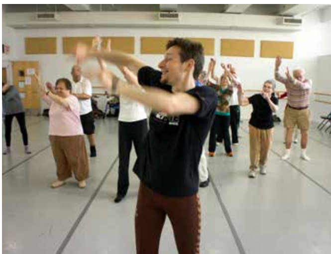
The Mark Morris Dance Group's Dance for PD® program invites people with Parkinson's and their families in 17 countries around the globe to experience the joys and benefits of dance while creatively addressing condition-specific concerns.

The John F. Kennedy Center for the Performing Arts in Washington, DC supports state coalitions providing arts services to promote artists with disabilities and to offer accommodations for people with disabilities to participate fully in arts engagement for better health and education.