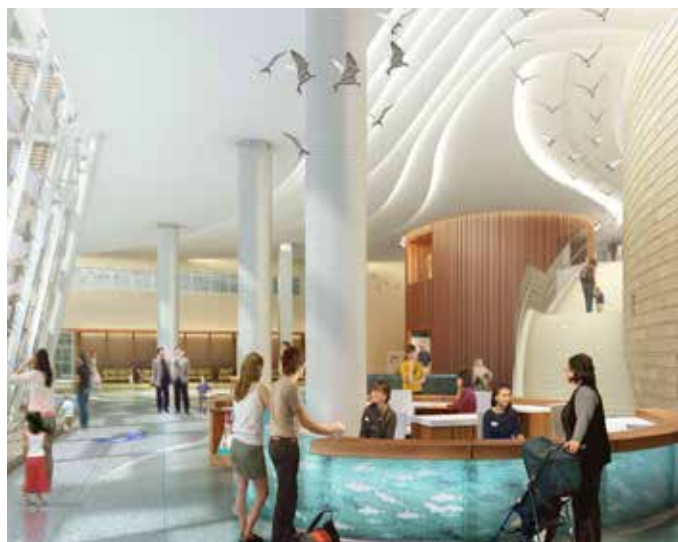
Lucile Packard Children's Hospital Stanford Arts & Architecture Program in Palo Alto, California is designed to integrate art throughout interior and exterior hospital spaces. Representatives from the hospital board, medical staff, and construction and design teams were involved in the process with consulting support from Aesthetics, Inc.

There are many architects who artfully design their buildings and actually consider their installations to be art themselves. When they also include evidence-based design principles, there is potential for the building to be a foundation for a healing environment. Interior designers can add the appropriate evidence-based use of color, textures, and patterns, as well as engaging and comforting furniture arrangements. This creates another layer to form supportive, nurturing experiences for patients, families, and staff. When art is thoughtfully integrated into the fabric of the building, floors, walls, and lighting through a collaboration between artists and professional designers, we return to the renaissance of art. There are several excellent examples of this type of collaboration, Lucile Packard Children's Hospital being one.