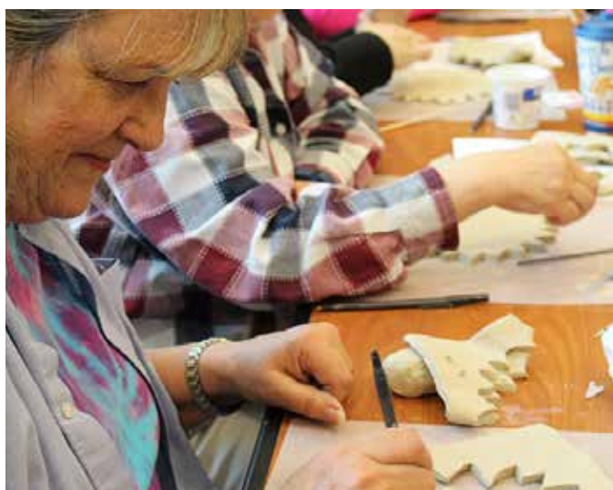
The Samaritan Cancer Resource Center in Albany, Oregon hosts monthly arts workshops for cancer survivors and their families through the Samaritan ArtsCare Program .

The urgent need for professionalization of artists working in healthcare settings, healthcare arts administrators, and healthcare arts consultants has been noted throughout this paper. NOAH is currently working with the Arts in Health Certification Commission on the development of national standards for training and credentialing of artists in healthcare, and plans are in place for a future focus on healthcare arts administrators. Although this important work is underway, much remains to be done in supporting the process of professionalizing the field. Introducing and coordinating the launch of national standards and credentialing processes will require a robust infrastructure of organizational support, as well as excellent partnerships across the arena and with educational institutions. NOAH has prioritized this action step as a national goal, and is eager to partner with others to move forward with continued growth and professionalization of Arts in Health.