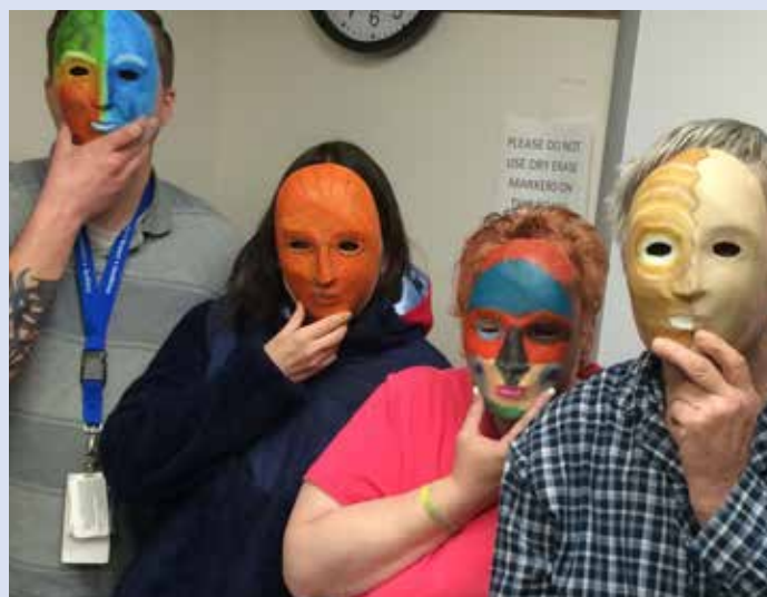
The Kentucky Center Arts in Healing program in Louisville, Kentucky facilitates the creative self-discovery and artistic expression of patients, caregivers, and staff through 38 programs in 23 healthcare facilities.