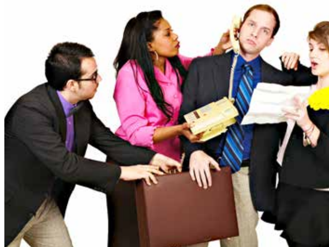
Kaiser Permanente's Educational Theatre program in the Georgia region holds 60-minute productions entitled "Acting on Stress" for adults. Through drama and guided discussion, adults receive education and skills for dealing with stressful work and personal situations.